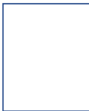
Rear Commodore Vacant